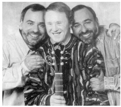
"Everyone can be a... Singer with the Band!"

Some issues for the future include Bylaws and meetings with other Regional Consumer Forums.